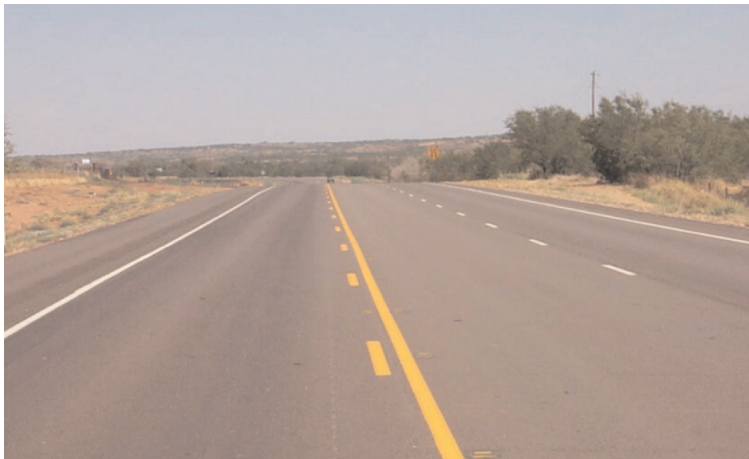
Figure 1. Passing lane section on two-lane highway

Many of Texas' highways are two-lane roadways and will remain so for the foreseeable future. As traffic volumes increase, motorist satisfaction and traffic performance on those roadways will decrease. The traditional answer to these problems, provision of a four-lane roadway, appears to be out of reach for many of these facilities due to fiscal constraints. An alternate solution is the provision of periodic, short-term passing lanes, otherwise known as a "Super 2" design, shown in Figure 1 . These lanes allow motorists increased opportunities to safely and easily pass slower vehicles, improving traffic flow at a much lower cost than a traditional expansion to four lanes.