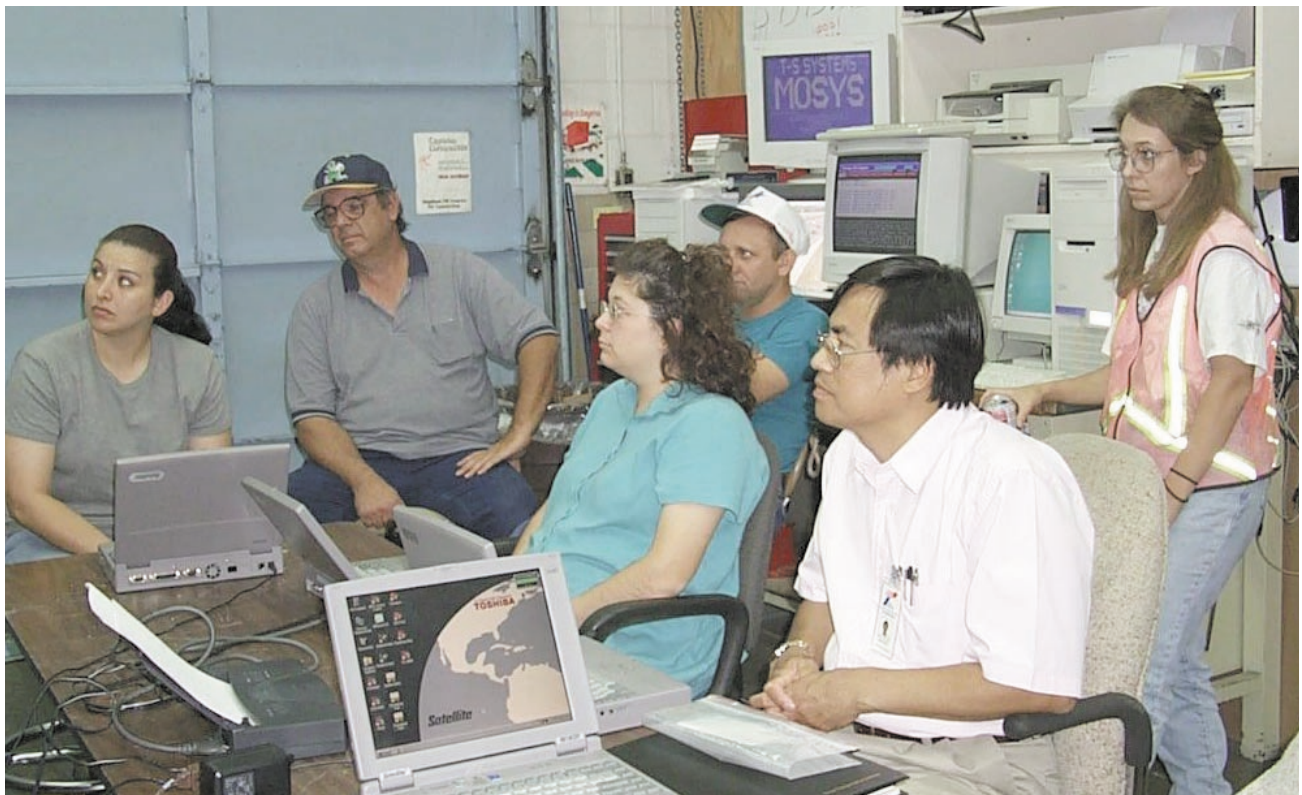
Figure 3. TxDOT Fort Worth staff during a training session at the signal shop

Due to extensive detectorization and automated data collection and control capabilities from the central location, the Arlington ramp metering system provides a unique setting for testing various control strategies, optimization, and incident detection algorithms. TxDOT staff and researchers could take better advantage of these opportunities if a user-friendly and complete version of central software were available. Thus, the researchers recommend that TxDOT invest in the conversion of the current OS/2-based central software to Windows NT platform. This will also allow the District to link the ramp metering system to other components of the traffic management system.