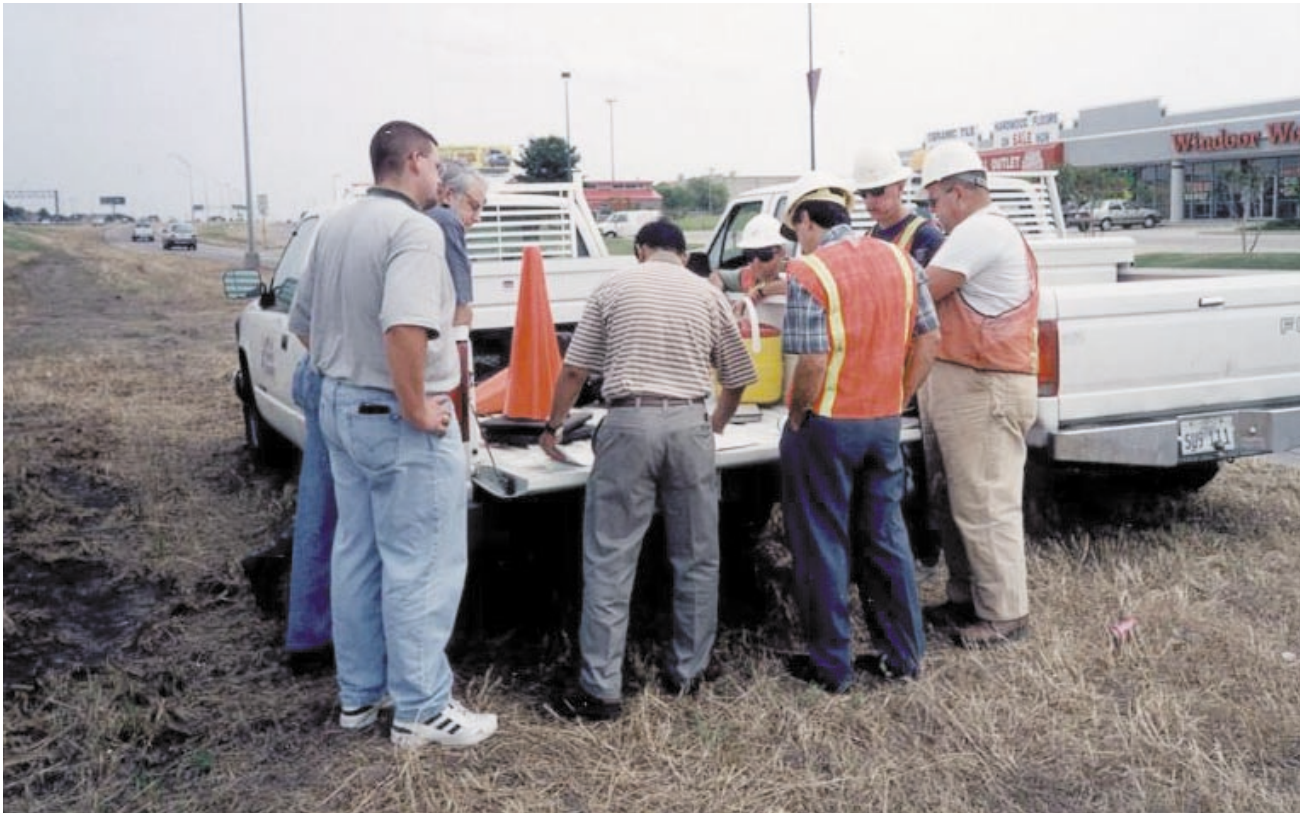
Figure 2. TTI, TxDOT, and contractor personnel discussing detector design in the field