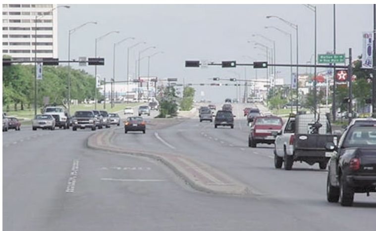
Figure 1. Raised median treatment along Texas Avenue in College Station, Texas

Figure 1 shows the College Station corridor after construction of the widening