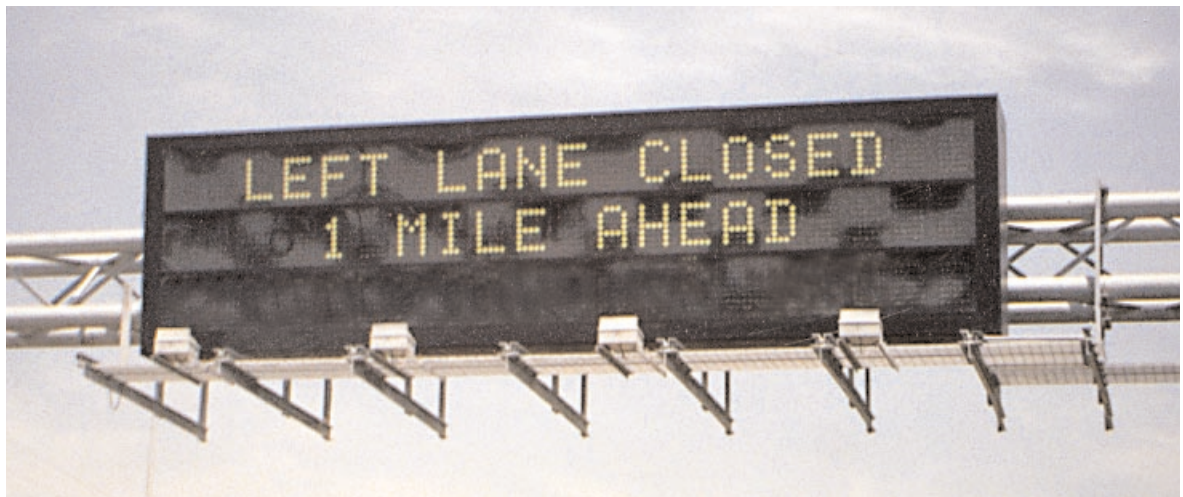
Dynamic message signs (DMSs)

participate in laboratory sessions designed to answer these questions. Laptop computers were used to simulate DMS message displays in order to answer many of the questions; for the other questions, researchers relied on pen-and-paper surveys. The laboratory sessions were designed to determine the level of recall and comprehension of the information contained in each message. Reading times and message formatting preferences were also collected in some instances.