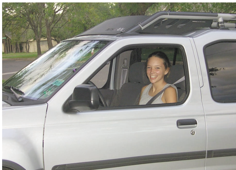
Figure 1. A newly licensed teenage driver

During Phase I, researchers identified perceptions and problems associated with traffic control devices through surveys of driver education instructors, law enforcement personnel, and teenage drivers. The researchers used the results of these evaluations to develop recommendations for improving teenage driver understanding of traffic control devices. Researchers also developed recommended descriptions of devices for inclusion in the driver education curriculum. During Phase II of the project, researchers identified critical driver behavior issues for teenage and older drivers