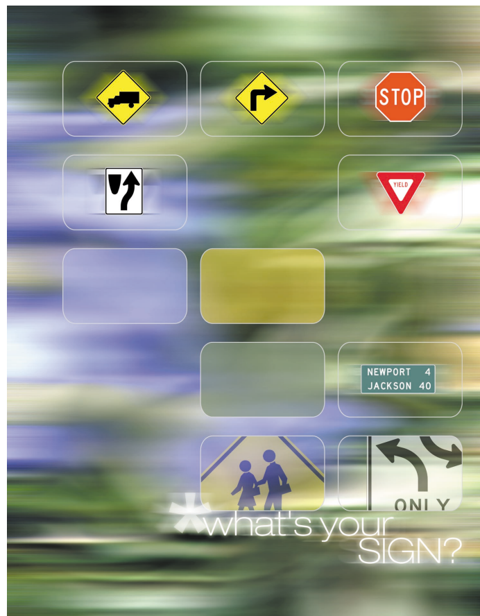
Figure 3. Cover of traffic control devices notebook

The researchers recommend using the web pages and notebook to enhance the modules developed for the Texas Education Agency's updated driver education curriculum for teenage drivers. Additionally, the web site will be linked to related sites, making it accessible to other drivers.