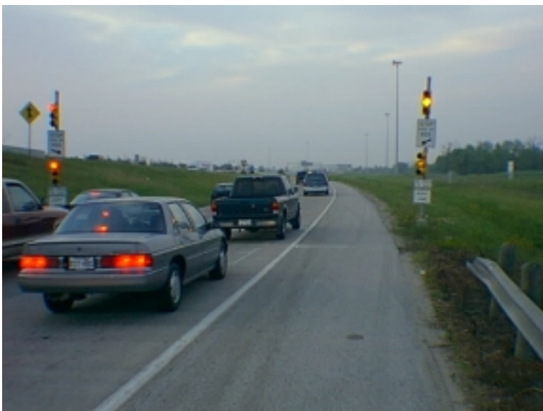
Figure 1. Dual-Lane Ramp Metering in Houston

Both the general public and TxDOT judged the overall ramp-metering program to be successful. The initial ramp meters were all single-lane designs, releasing one vehicle per green signal and providing a metering capacity of about 800 vehicles per hour (vph). These meters are similar to those deployed in Texas in the late 1960s. One major challenge faced by the ramp metering effort was the high