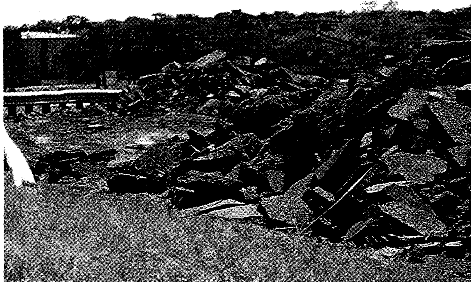
When old asphalt is removed, it can be salvaged and reused.

The laboratory and field performance of RAP as a maintenance mixture can be improved by mixing the RAP with a recycling agent. The laboratory properties and field performance of raw RAP and processed RAP can be significantly improved when blended with commonly available maintenance mixtures such as hot-mixed, cold-laid asphalt concrete pavement and cold-mixed LRA pavement.