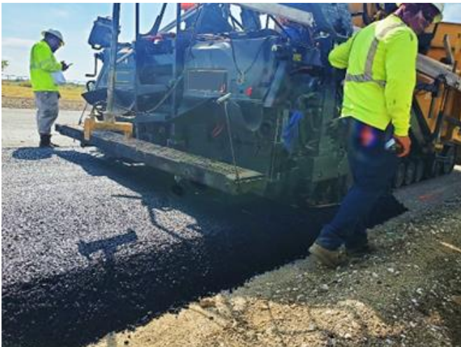
Figure 1. Thick-Lift Paving with a Tamper Bar Paver.

Thick-lift paving is the placement of asphalt concrete in lifts thicker than the allowable maximum. A tamper bar paver (Figure 1) might address concerns of poor compaction and ride quality in thick-lift paving since tamper bar screeds provide greater compaction behind the paver than a typical vibratory screed. The purpose of this research was to determine whether a tamper bar paver can effectively place asphalt concrete in thick lifts and identify the best practices to do so.