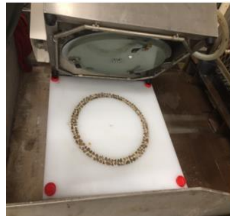
Figure 2. DFT Test on Aggregate (Virgin or RAP).

Research Performed by: Texas A&M Transportation Institute