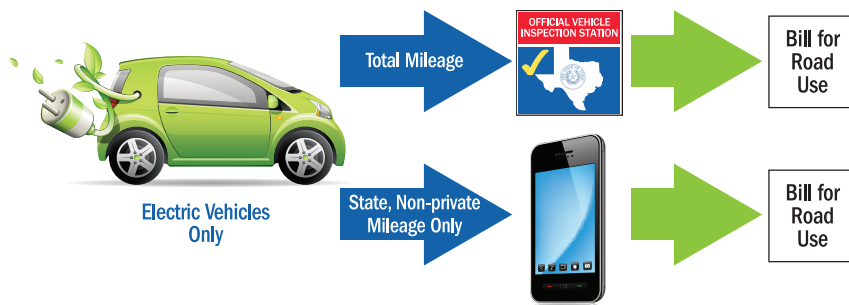
A Pilot Program Targeting Electric Vehicles Could Follow Either the Odometer Reading or GPS-based Implementation Model

This scenario targets current non-user-fee-paying vehicles, representing about 0.1 percent of the entire statewide vehicle fleet. This approach would immediately gather revenue from vehicles not currently covered by the fuel tax and provide a model to use in potentially phasing standard passenger vehicles into the system. From a public acceptance standpoint, this model is perhaps the easiest to implement. In general, focus group participants favored charging electric vehicles for their use of the roadway system.