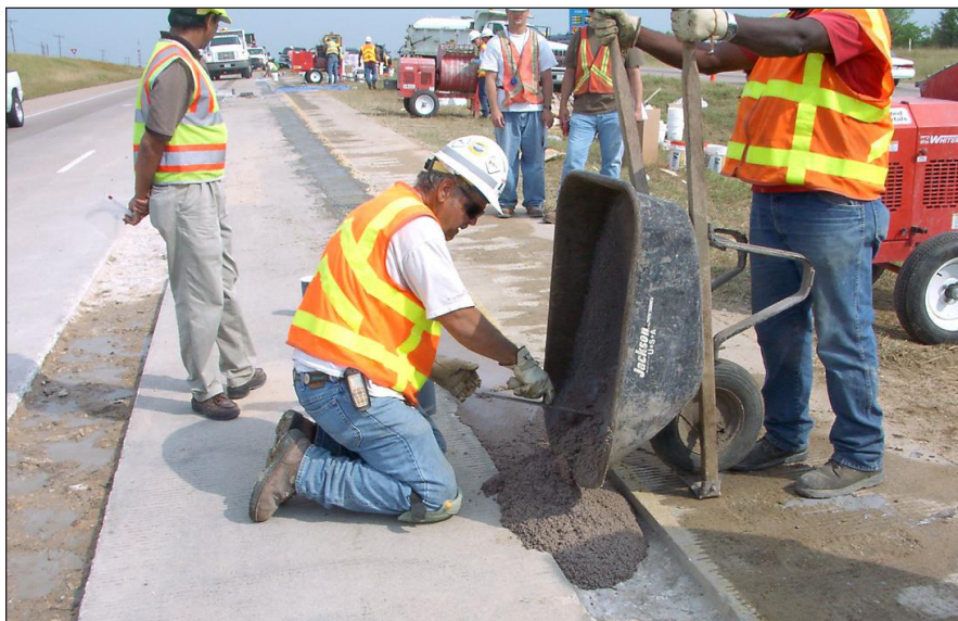
Figure 2. Placement of FlexPatch by Crews in Ft. Worth.

wet surface was not an issue. The importance of a material’s viscosity and set time in the field was also manifest. A material should have sufficient viscosity to be finishable and easily worked, but be stiff enough to keep its shape so that it does not overflow the patched area.