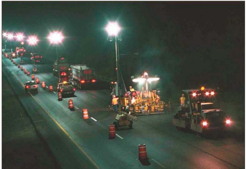
Figure 1. Across Texas, More and More Night Work Is Being Performed.

Crash rates on roadways are normally higher at night because visibility is reduced and a greater proportion of drivers are impaired or drowsy. On the other hand, traffic volumes are much lower at night, which reduces the overall level of traffic exposure to work activities. Working at night also reduces the frequency and extent of traffic queues that are created, a condition that correlates with increased crash risk. In this project, researchers quantified and