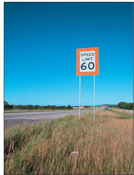
Figure 1. Orange-Border Speed Limit Sign.

There are a wide variety of available treatments with varying degrees of effectiveness in improving work zone speed limit compliance (see Figure 2).