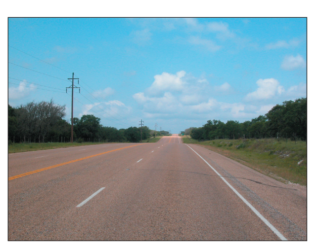
Example of Four-Lane Highway