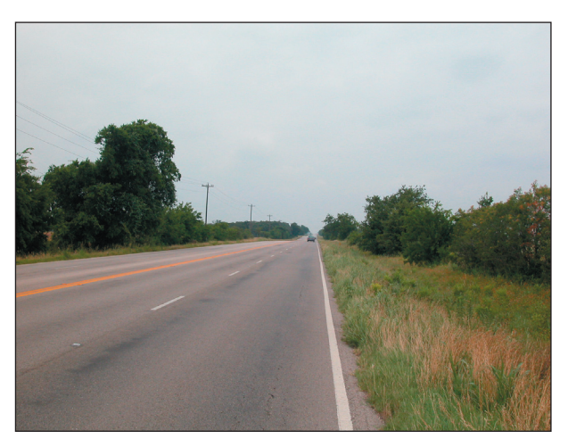
Example of Four-Lane with Minimal Shoulder