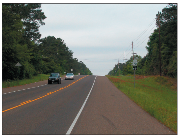
Example of a Two-Lane with Wide Shoulder