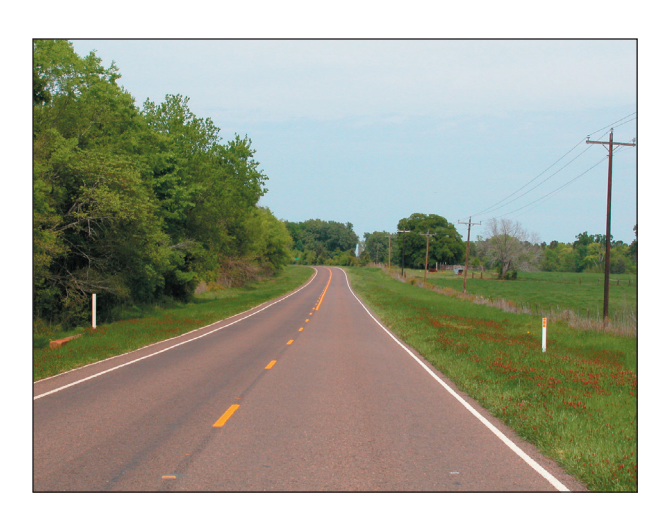
Example of Two-Lane Highway