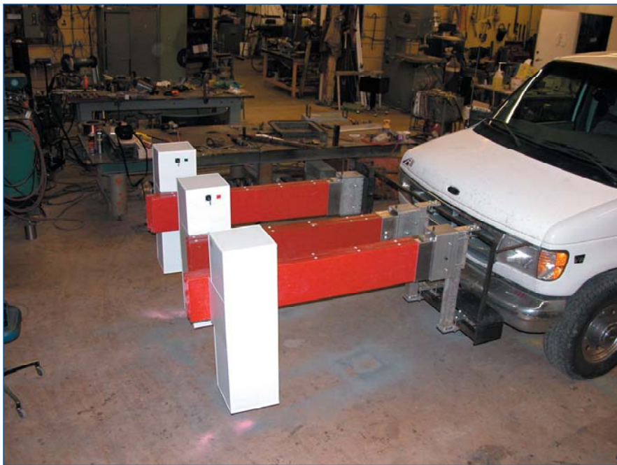
Figure 3. One-Pass GPR Data Collection System.

Verification tests conducted in this project matched well with previously recommended criteria for detecting segregation. With thermal imaging, locations with temperature differentials greater than 25 °F should be inspected for segregation. With GPR, recommendations differ according to mix type: