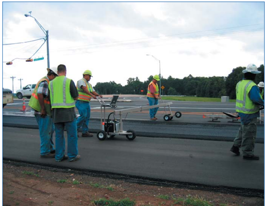
Figure 1. A New Infrared Sensor Bar Provides Improved Data Collection.

With the full coverage devices, the research team found that the new infrared sensor bar, shown in Figure 1 , provided a much-improved method to collect and analyze thermal imaging data of HMA paving projects as