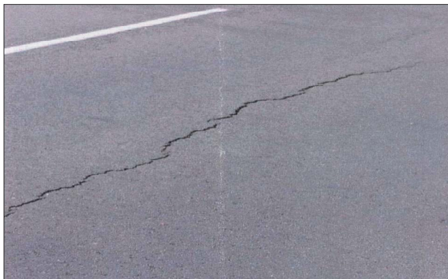
Figure 2. A Typical Shrinkage Crack of the Pavement Surface in the Vicinity of Trees and Other Vegetation.

We used the design program to compare the successful treatments predicted by the new procedure with the criteria