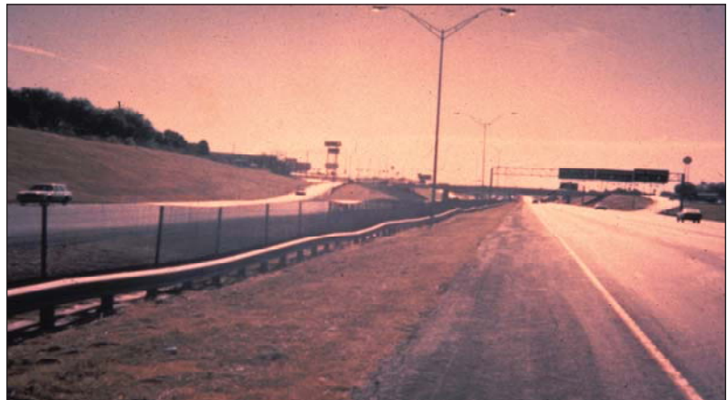
Figure 1. A Typical Effect of Swelling Soil.

The principal problems with pavements on expansive soils are that