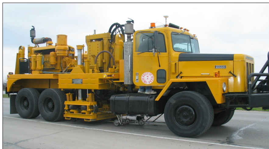
Figure 3. The Rolling Dynamic Deflectometer.

next joint location. Mid-depth slab temperatures should be measured at the start and end of the test.