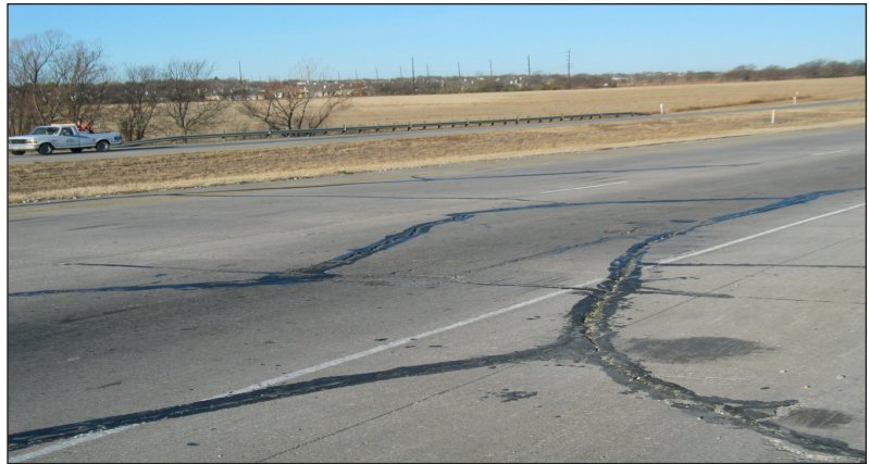
Figure 1. Distressed Jointed Concrete Pavement.

The variability of pavement condition, joint load transfer efficiency, and slab support along projects is a major issue contributing to both strategy selection and treatment performance. The traditional asphalt overlays typically fail rapidly on problem jointed concrete pavements. Project O-4517 was initiated first to develop recommendations on how to structurally evaluate existing JCP pavement sections, and second to monitor the performance of experimental test sections around Texas where innovative treatments were applied. Detailed field and laboratory studies were carried out and reported in the three project reports.