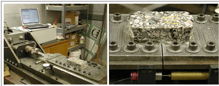
Figure 5. TTI Overlay Tester (a New Version Is in Operation in TxDOT's Flexible Pavement Branch of the Construction Division).

Childress District. Until current ongoing studies are complete, TxDOT should consider the following overlay test mix design criteria when selecting overlays for JCP in good condition: