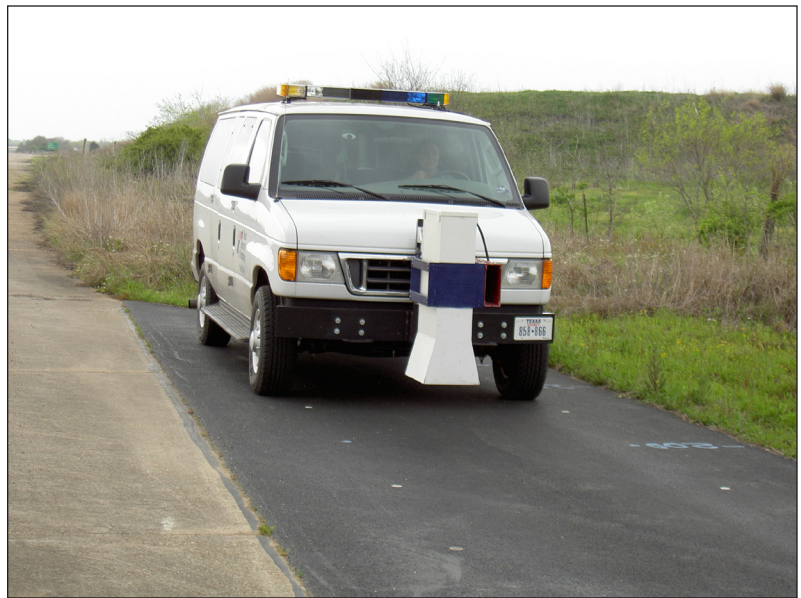
Figure 1. TxDOT's GPR System.

With the current system, GPR data are processed independently of FWD analysis. GPR data are processed with the COLORMAP analysis system, and FWD data are processed with MODULUS 6.0. There is substantial synergy in combining the analysis capabilities of both systems. For example, backcalculation of the layer thickness of the pavement at the location of the deflection data must be input. These data are typically obtained from