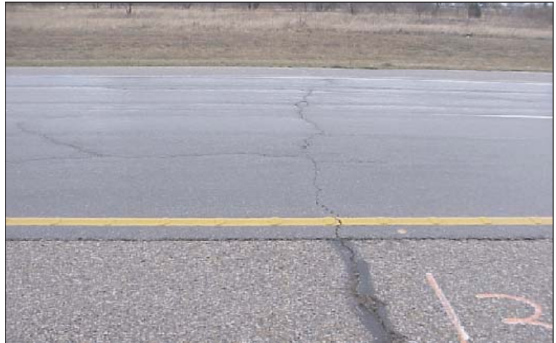
Figure 1. Reflection Cracking.

Stiffer binders and good stone-to-stone contact may provide improved rut resistance, but they may also reduce mix flexibility and crack resistance. Cracks appear in flexible pavements primarily through either fatigue or reflection cracking mechanisms. The reflection cracking mechanism has received less attention than classic fatigue.