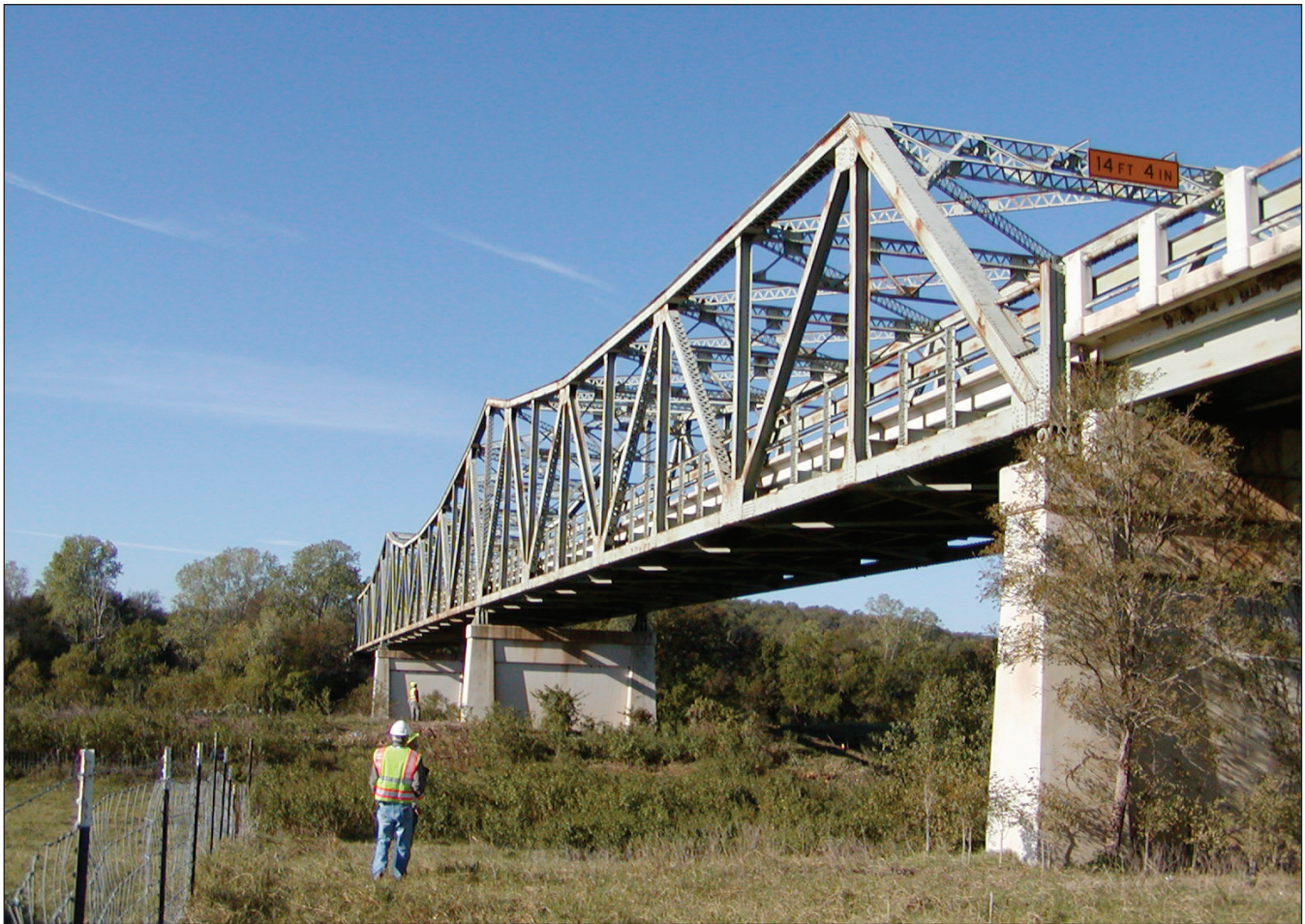
Figure 2. U.S. 281 over the Brazos River in Palo Pinto County, Texas.