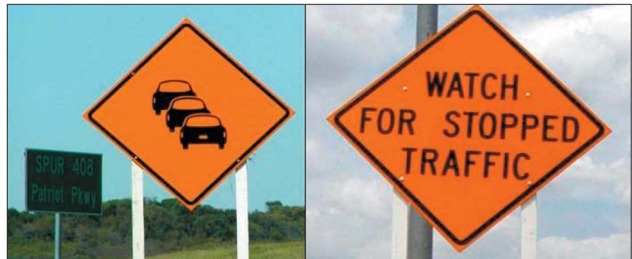
Figure 2. Congestion Warning Signs Used in Field Tests.