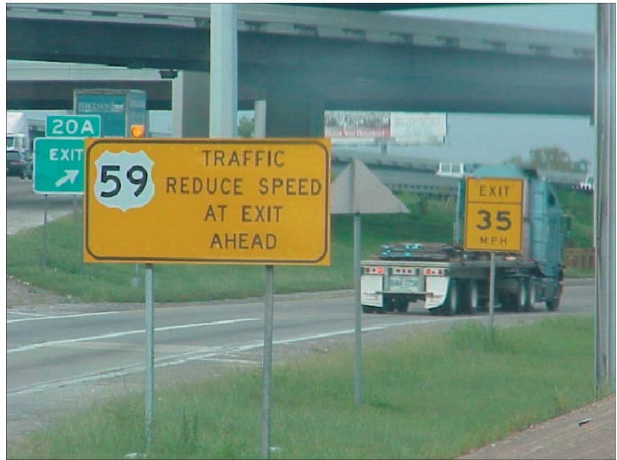
Appropriate speeds on freeway-to-freeway connectors may be different for trucks than smaller vehicles

in the 2000 Manual on Uniform Traffic Control Devices (MUTCD) may be used to determine sign placement, considering both approach speed and curve speed. It is also recommended to use the new W13-5 sign (2000 MUTCD) to supplement the W13-2 (EXIT + speed advisory sign) and W13-3 (RAMP + speed advisory sign). The W13-5 provides the term “CURVE” instead of “RAMP” or “EXIT” with an advisory speed.