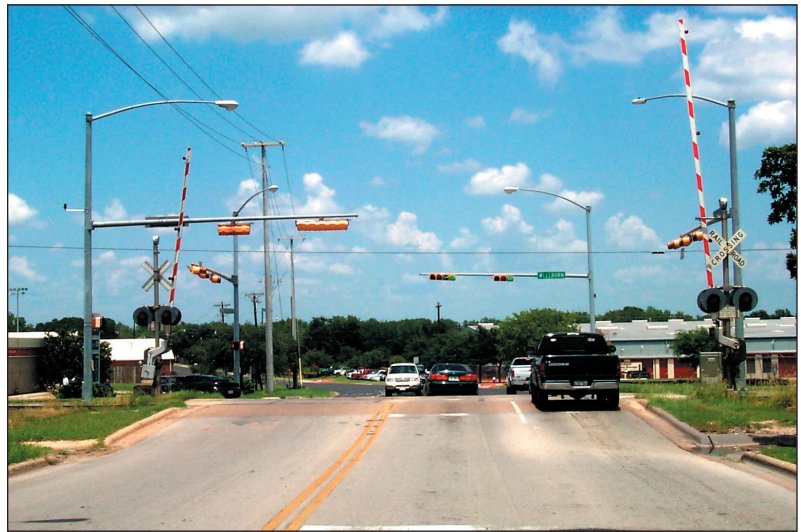
Figure 1. Typical Highway-Rail Grade Crossing in Texas.

The objective of this research project was to increase safety and reduce disruption in coordinated operations along arterials with railroad preemption by improving the operation of traffic signal controllers near highway-railroad grade crossings. Significant safety concerns and operational problems exist at railroad-highway grade crossings adjacent to signalized intersections. Current TxDOT procedures, in particular the Guide for Determining Time Requirements for Traffic Signal Preemption at Highway-Rail Grade Crossings