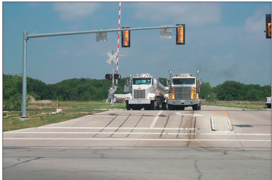
Figure 3. Heavy Vehicles at Grade Crossings Have a Significant Impact on Operations.

The time difference between when the last vehicle clears the crossing and the arrival of the train at the crossing is referred to as separation time. Separation time is generally considered part of the preemption sequence. It typically represents the time at the end of the preemption sequence after the signal has transferred the right-of-way to the approaching train and queued vehicles have cleared the tracks. Previously, separation time was