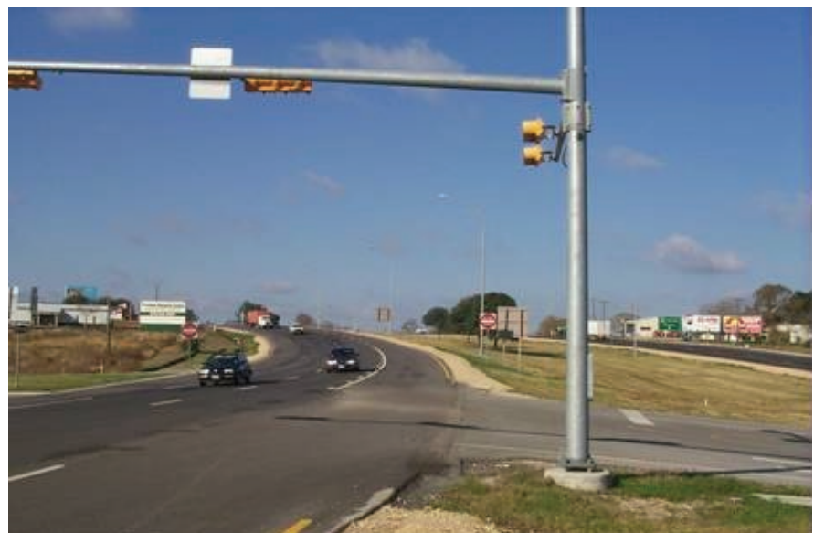
Figure 3. Eastbound US 290 Approach at Brenham before AWEGS.

Field testing of AWEGS was conducted at two sites in Waco and Brenham, Texas. The Waco site was a high-speed, two-lane rural road. Figure 1 shows the site before implementation of AWEGS. Figure 2 depicts an AWEGS advance warning sign during field testing. The second site was a very high-speed, high-volume, four-lane divided highway located on the US 290 bypass of Brenham.