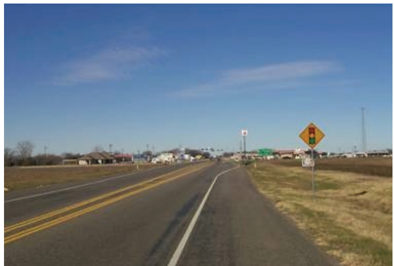
Figure 1. Westbound SH 6 Approach at Waco before AWEGS.

A research team from the Texas Transportation Institute (TTI) conducted a two-year project to accomplish the goal of the project. A new system, named Advanced Warning for End-of-Green System (AWEGS), was developed for applications on high-speed signalized intersections in isolated (non-coordinated) locations. The goal of AWEGS operation is to slow