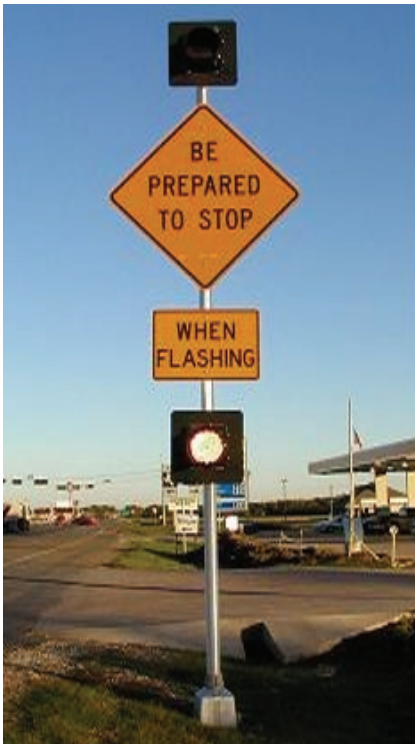
Figure 2. AWEGS Advance Traffic Control Sign (W 3-4) in Waco.

drivers approaching a signalized (traffic actuated) intersection at high speed to a speed that allows them to safely stop when the signal turns yellow and then red shortly thereafter.