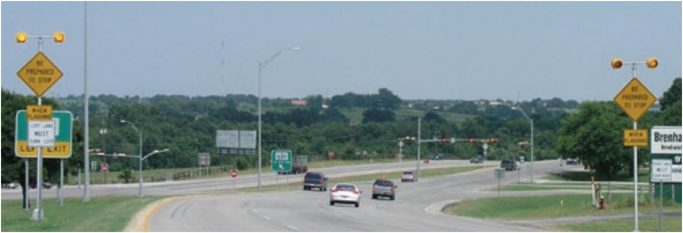
Figure 4. Eastbound US 290 Approach at Brenham after AWEGS Installed.