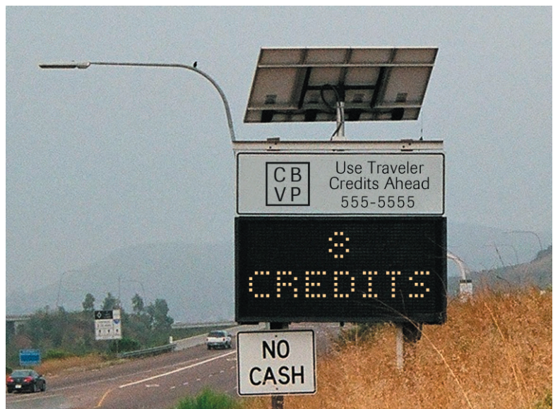
Possible Toll Display for CBVP.

Travelers would have several options on how to purchase credits from the toll authority in charge of the CBVP program (see transaction diagram). The system would operate in much the same way as a toll road with electronic toll collection except the cost of the credits would be set in a free market system (much like a stock