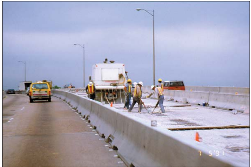
Figure 1. Protecting Both Workers and the Traveling Public in Work Zones Is a High TxDOT Priority.

Unfortunately, traditional police crash report forms do not capture work zone features with the level of detail and consistency needed for a meaningful analysis. Therefore, TxDOT contracted with the Texas Transportation Institute (TTI) to develop a method to obtain detailed work zone information from fatal crash locations, collect and analyze the information, and provide countermeasure recommendations to reduce fatal work zone crashes statewide.