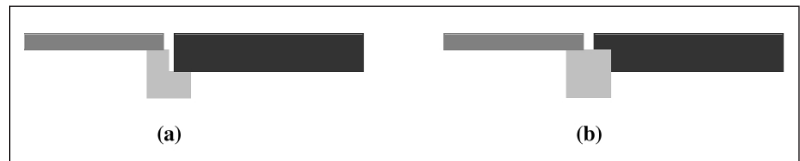
Figure 1. (a) Stepped Bent Cap. (b) Dapped Girder.

Three different dapped details used in Texas