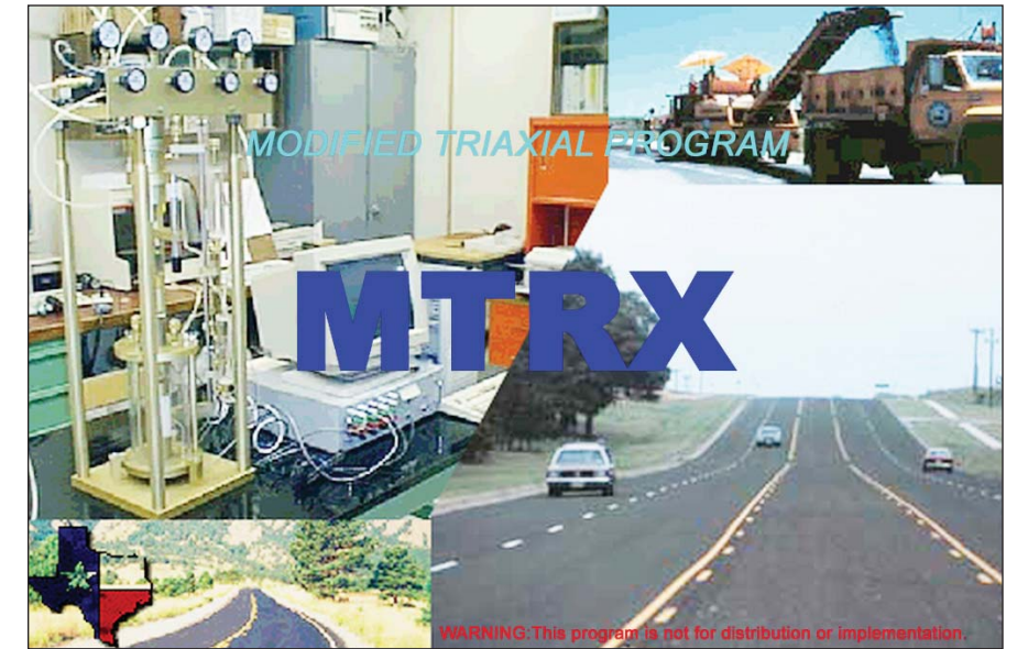
Figure 3. New Texas Triaxial Design System for Windows.

These new tools are the next step in TxDOT's continuing