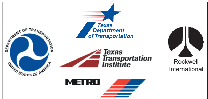
Figure 1. The TransLink® Partners.