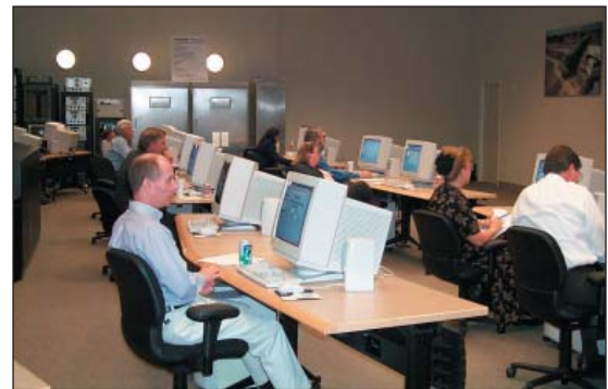
Figure 4. Professional Development Activities Conducted in TransLink® Laboratory.