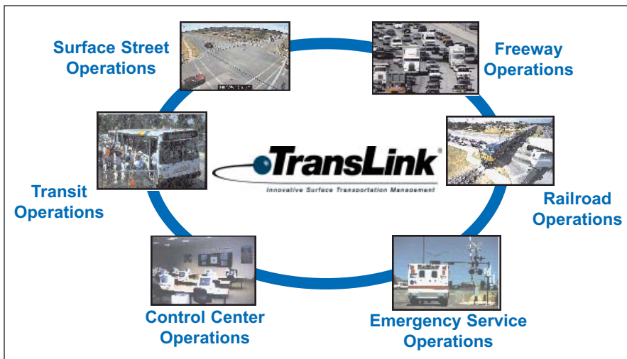
Figure 2. TransLink®: Linking the Elements of the Surface Transportation System Improves the Efficiency of the Entire Surface Transportation System.