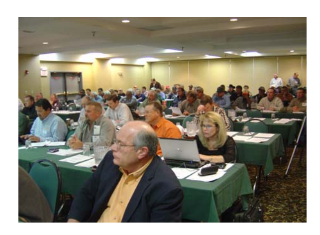
2008 TxAPA Seal Coat Conference participants