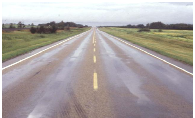
Rutting Addressable with Microsurfacing

Microsurfacing should not be used to add structure, fill deep ruts, stop reflection cracking, and correct excessive longitudinal roughness problems. Treating fatigue or alligator-cracked pavements with microsurfacing is also not appropriate. Microsurfacing can be used as rut filler when some requirements are met. Pavement is structurally sound for the future traffic over the expected life of the microsurfacing. The ruts were caused by mechanical compaction of the pavement structure. Use microsurfacing when ruts are flat, not sharp, or showing dual wheel marks and when ruts are indentations only, not an indentation between upward heaves. For rut depth of greater than half an inch, a special rut filling spreader box (rut box) should be used to fill the ruts before final surface is placed; for depth of less than 1/2 inch, full-width scratch coat pass should be used to level the surface before the final surface is placed. For depths greater than 1 inch, use multiple placements of microsurfacing using the rut box to fill the rut.