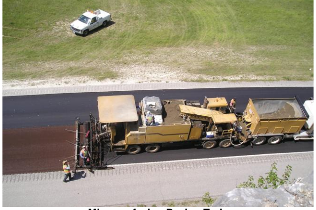
Microsurfacing Paving Train

Microsurfacing is a laboratory designed mixture of polymermodified emulsified asphalt, aggregate, mineral filler, water, and other additives accurately proportioned, mixed and uniformly spread over a properly prepared surface. The mixture is made by a specialized machine and placed on a continuous basis by mixing the materials simultaneously in a pug mill. Due to the mixture's consistency, it can be evenly spread over the pavement, forming as adhesive bond.