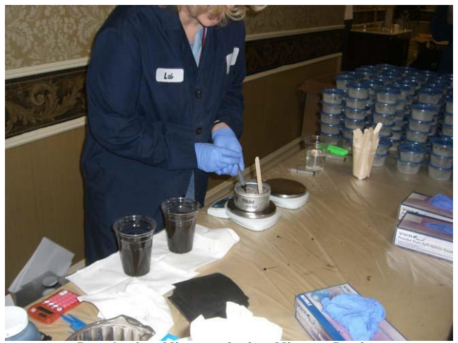
Developing Microsurfacing Mixture Design