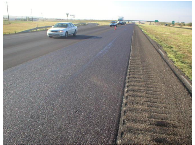
High Traffic Roadway after Microsurfacing Application

Microsurfacing should be used instead of seal coats at approaches to major intersections, on urban arterials and interstate pavements with an asphalt surface, and on other high traffic asphalt surface pavements. When traffic volumes are too high and there are too many turning and stopping movements for seal coats, microsurfacing is a better option. On low volume and FM roadways microsurfacing should be used to create a uniform surface when multiple seal coats or patching have resulted in a nonuniform surface making it difficult to construct good seal coat.