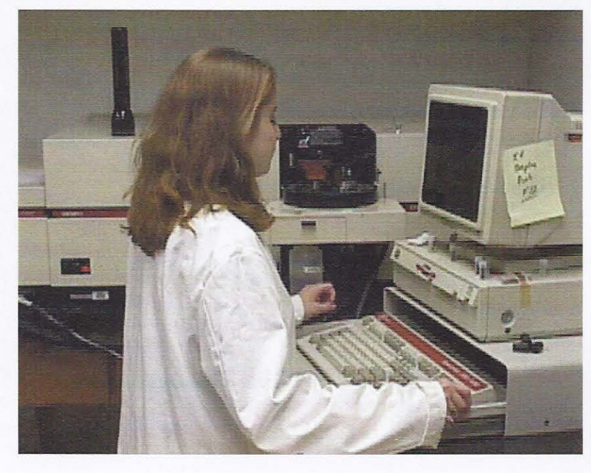
Figure 1. Graphite Furnace Atomic Absorption Spectrometer

Materials investigated in this project include aggregate (limestone, caliche, siliceous gravel, siliceous sand, limestone rock asphalt, and sandstone), cement, lime, bottom ash, fly ash, reclaimed asphalt pavement (RAP), recycled concrete pavement (RCP), and bituminous binders.