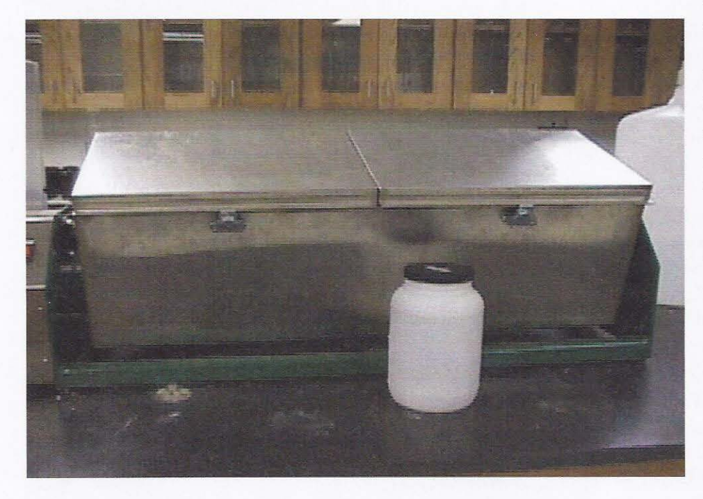
Figure 2: Extraction Vessel and Tumbler

The results of the cutback materials range from 1.294 to 0.100 mg/kg.