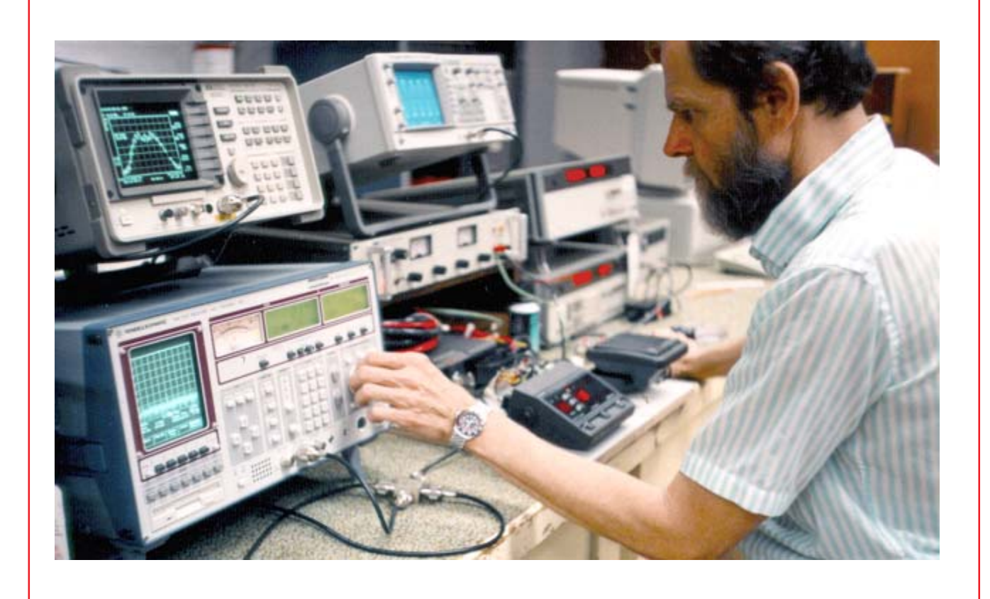
Figure 2: Bench-Top Testing with a TxDOT Radio in a Laboratory at Texas Tech University