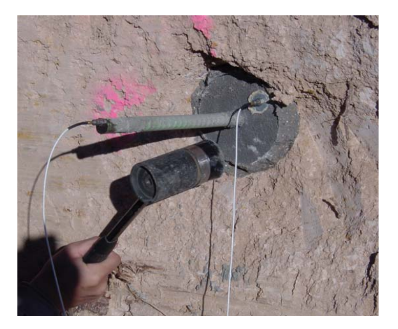
Figure 4 Hitting the Grout Column Head with 0.2-lb Hammer