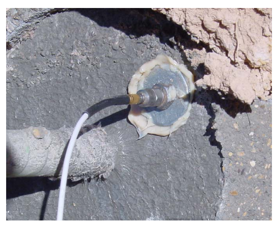
Figure 3 Accelerometer Attached to Washer on the Grout