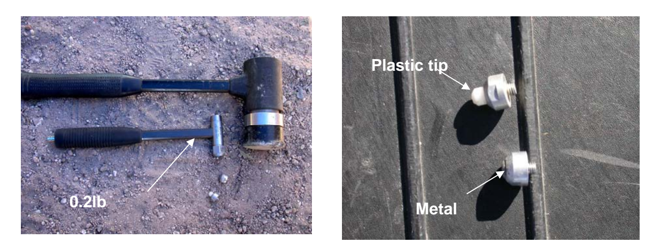
Figure 2 Instrumented Hammer with Interchangeable Metal/Plastic Tips