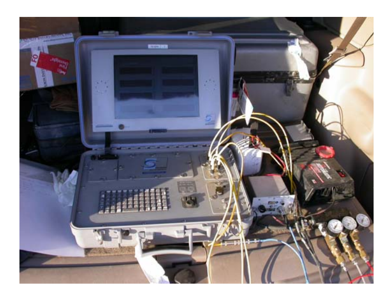
Figure 1 Freedom Data PC Used Sonic Echo Testing