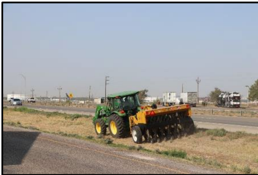
Figure 6-3. A safety rest area demonstration planting in Midland, Texas.

In the fall of 2020, five of the six sites were seeded. The remaining site, Ward County, was seeded in the spring of 2021 due to an abundance of Lehmann lovegrass on the planting site. All sites were sprayed with glyphosphate to suppress or remove existing vegetation, and then seeded using a no-till seed drill Figure 6-3. Emergence data were taken bi-monthly, if possible, and are summarized in Table 6-3. A breakdown of the 5 different seed mixes chosen for each site can be found in Appendix B.