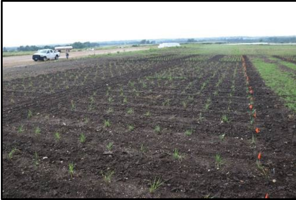
Figure 4-3. Initial evaluations of Indiangrass (front) and silver bluestem (back) located at the Daisy Farms Dairy in Paris, Texas.

Over the 3 year project period, plantings were undertaken in greenhouses at the South Texas Natives Farm (Kingsville, TX), Sul Ross State University (Alpine, TX), Texas A&M Agrilife Research- Stephenville (Stephenville, TX), and the USDA NRCS East Texas Plant Materials Center (Nacogdoches, TX). Greenhouse production numbers for FY 2019, 2020, and 2021 are illustrated in Table 4-1.