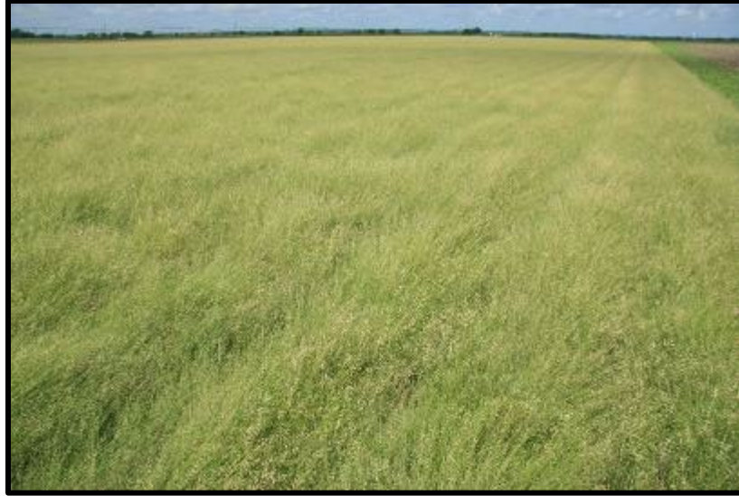
Figure 6-1. A Douglass King Seed Company commercial production field of Dilley Germplasm slender grama located in San Antonio, Texas.