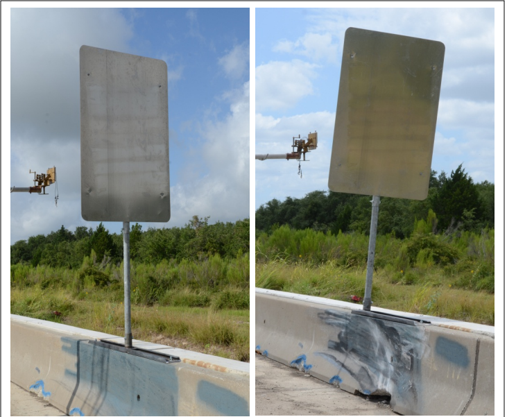
Figure 1. Concept 1: Sliding Base and Chute Channel.

would move along the chute once impacted by an errant pickup. The sign for the slotted 10 BWG post (Concept 8) leaned down downstream and had 89.0 inches of maximum permanent deflection on the field side. So, Concept 8 will need enough clearance (i.e., wide shoulder width on the other side). Ideally, Concept 8 would be used more practically on roadside barriers or bridge rails. As for the hinge and sacrificial pin design (Concept 4), it did not activate in the crash test. Thus, it is not expected to activate for less severe impacts (nuisance hits). However, if it had activated, and the sign had lain down on the face of the barrier, then a clearance of 2 ft minimum is needed for the shoulder side on each side of the barrier.