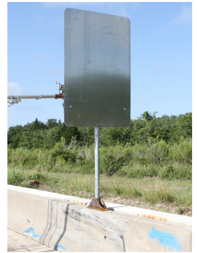
Figure 3. Concept 4: Hinge and Sacrificial Pin.