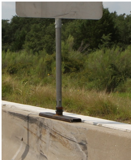
Figure 2. Concept 8: Slotted 10 BWG Post (3-Inch Slots).