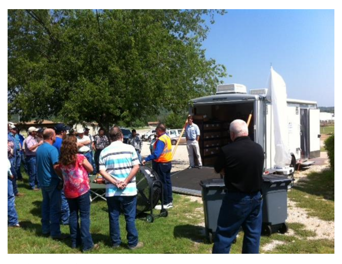
Figure 1: TxDOT Wildland Fire Emergency Response Trailer Demonstrated at the Maintenance Workshop

At each workshop, a course evaluation was distributed to the attendees. The first section of the evaluation are standard questions that TxDOT uses for all course evaluations, but the second category of questions were developed by TechMRT to assess the efficacy of the primary learning objectives of the workshop. Space was also provided for additional comments on how to improve the workshop and/or materials. This final report summarizes the proceedings of each workshop, including the evaluation scores and comments. Any significant changes made to the course materials after a workshop are also noted. The course evaluation sheets are provided in the appendix.