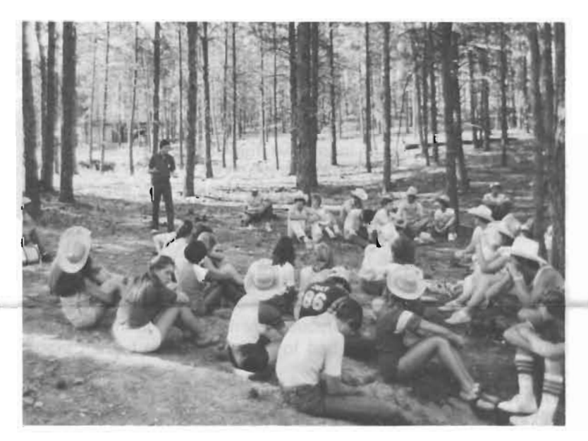
The Texas delegation participates in a work session during the Annual Conference of the National Student Safety Program held in Spearfish, South Dakota.

The U.S. Consumer Product Safety Commission presented