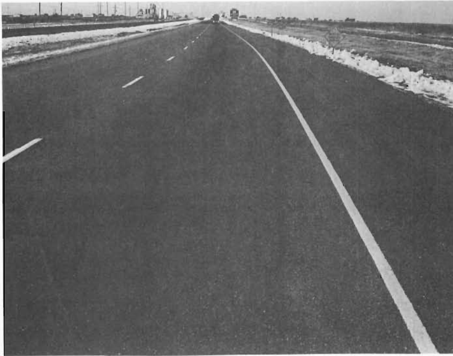
SYSTEM I - 1979 2 YEARS AFTER OVERLAY