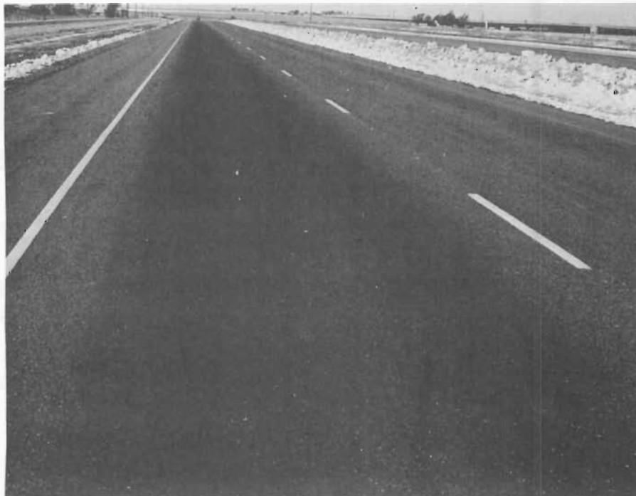
SYSTEM IV - 1979 2 YEARS AFTER OVERLAY