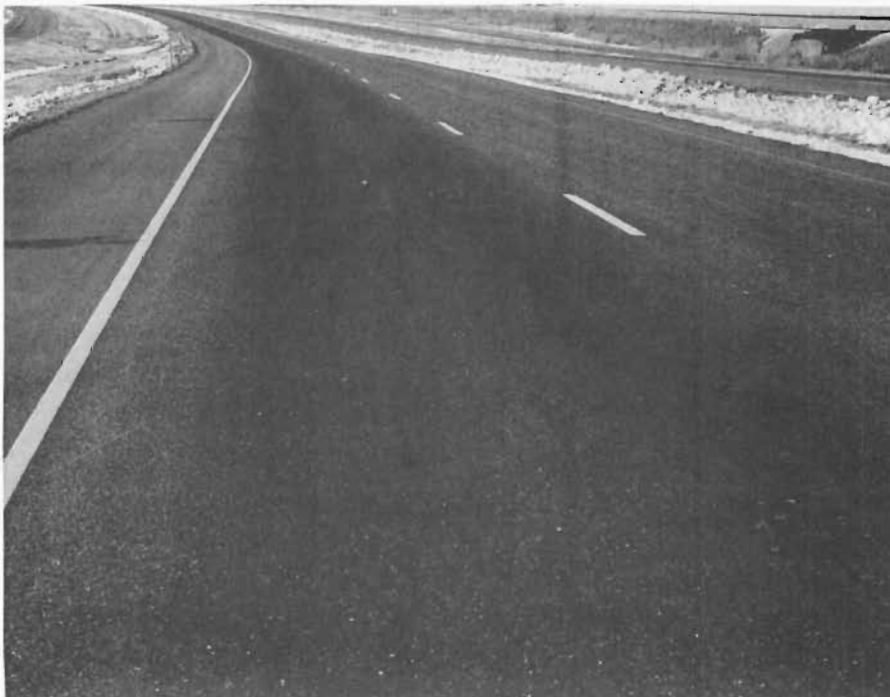
SYSTEM II - 1979 2 YEARS AFTER OVERLAY