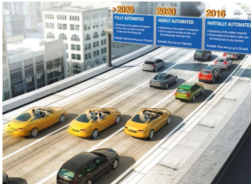
Figure 1. BMW's Autonomous Vehicle Agenda 2025 (44)